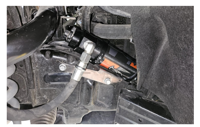
Fig. 11: Mounted reservoir.

NOTICE: Utilize the slots in the bracket to locate the clamps. Do not feed the clamps through the slots in