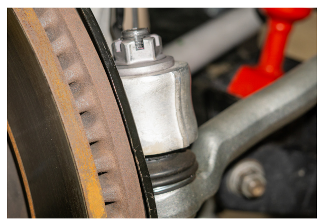
Fig. 14: Tie rod end link.

WARNING: Failure to maintain proper wheel alignment will result in premature tire wear and changes in vehicle handling.