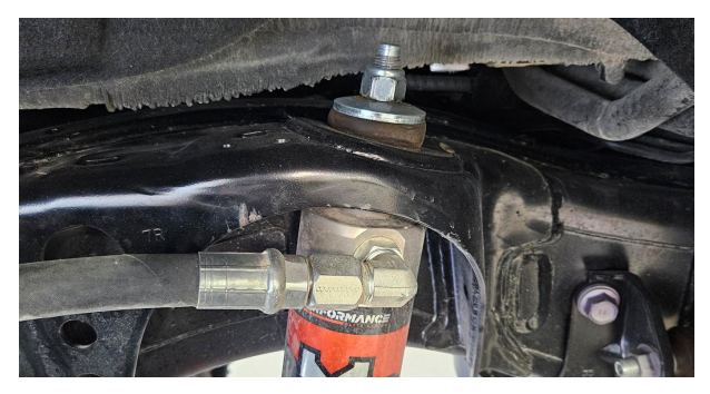
Fig. 21: Install the stem top nut (passenger side shown).