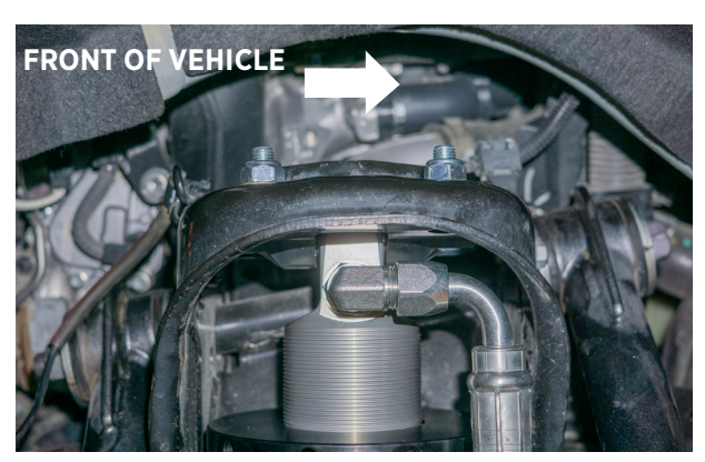
Fig. 9: The hose fitting faces outboard.

NOTICE: Minor trimming of the fender liner or air