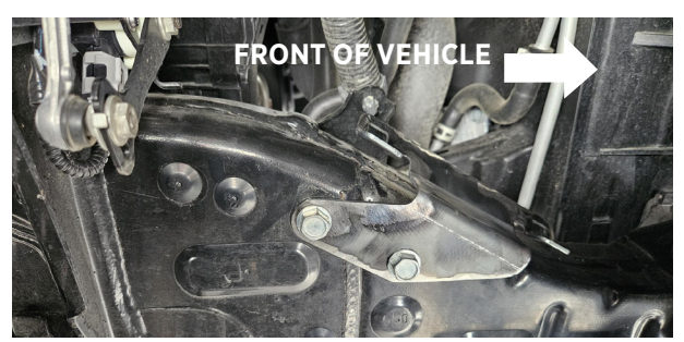
Fig. 5: Install the reservoir bracket assembly.