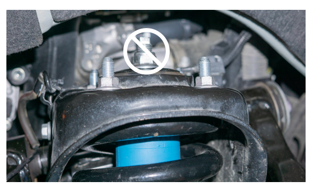
Fig. 7: Remove the four top hat nuts. Do NOT remove the center nut.