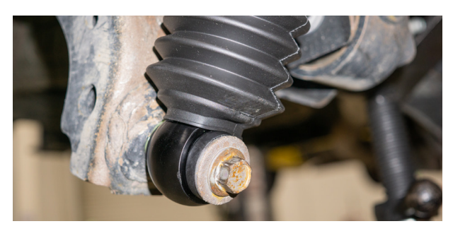
Fig. 22: Install the lower shock bolt (passenger side shown).

1. Reinstall the wheels and torque to OEM specifications.