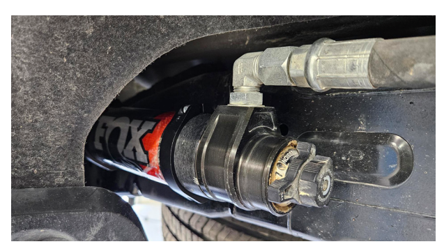
Fig. 23: Mount the reservoir to the bracket (driver side shown).