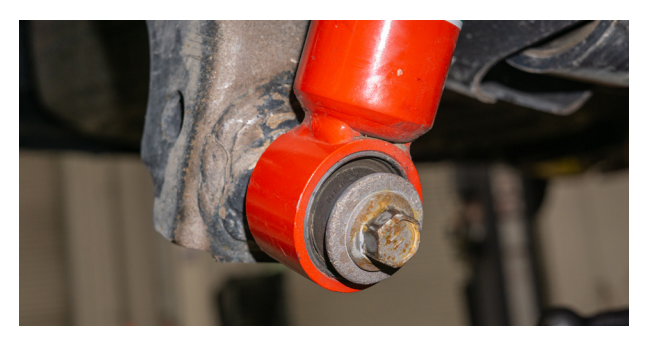
Fig. 18: Remove lower shock mount bolt.