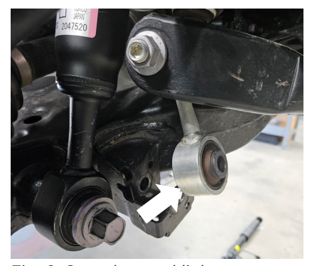
Fig. 2: Sway bar end link.