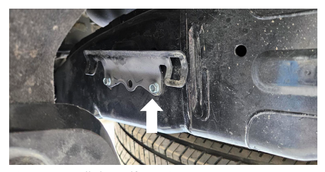
Fig. 20: Install the self tapping screw (passenger side shown).