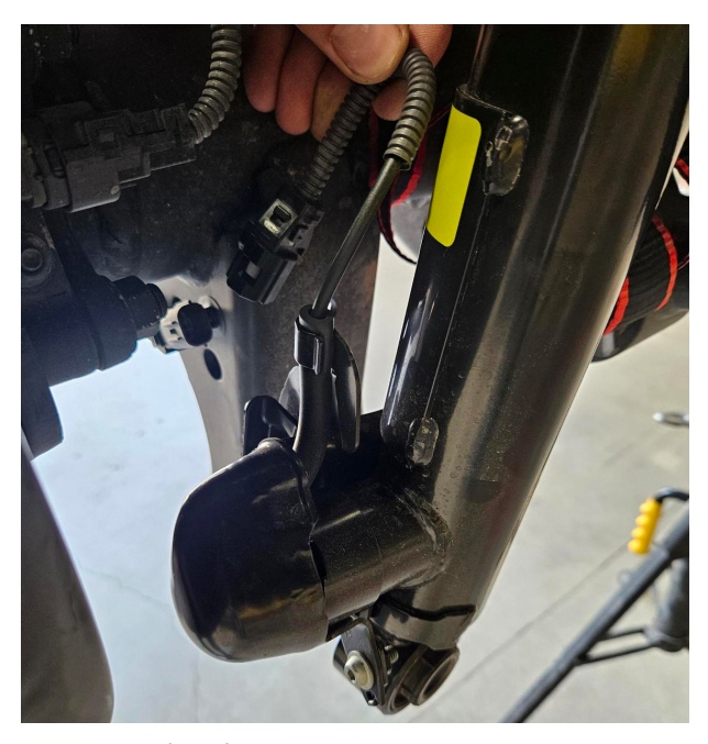
Fig. 16: Unplug the wire.