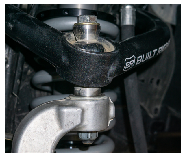
Fig. 13: Reattach UCA to the upright.

4. Reattach the UCA to the upright with the ball