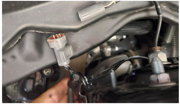
Fig. 6: Unplug the coilover wire.