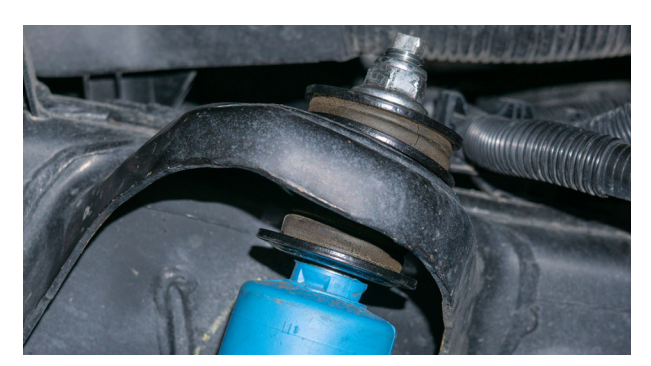
Fig. 17: Remove stem top nut.