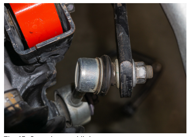
Fig. 15: Sway bar end link.