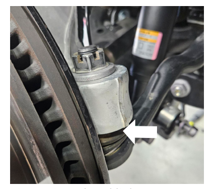
Fig. 1: Tie rod end link.

CAUTION: The UCA has spring tension (Fig. 3) and must be disconnected carefully to avoid minor injury. Wear safety glasses and keep hands and body parts clear of the UCAs.