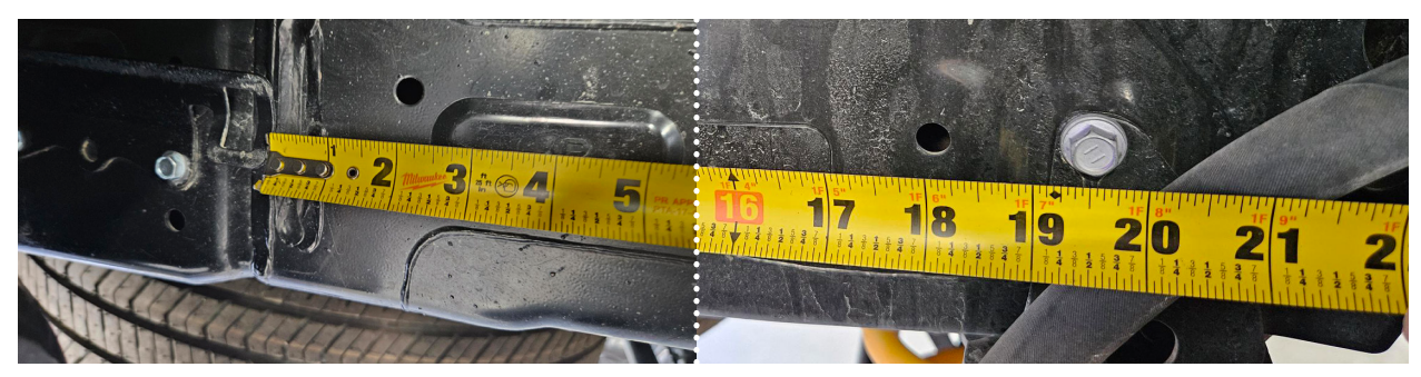
Fig. 19: Drill two pilot holes.