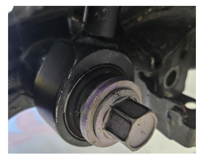
Fig. 8: Remove the bolt from the lower control arm.

6. If an aftermarket UCA is required with the FOX shock kit, install the UCA now. Follow the company's required specifications. After installation, continue to step 16.