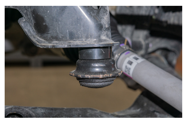
Fig. 10: Install the bump stop spacer if preload is added.