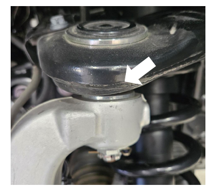
Fig. 3: Disconnect UCA.