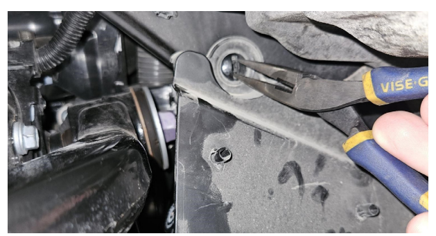
Fig. 4: Remove sway bar bracket.